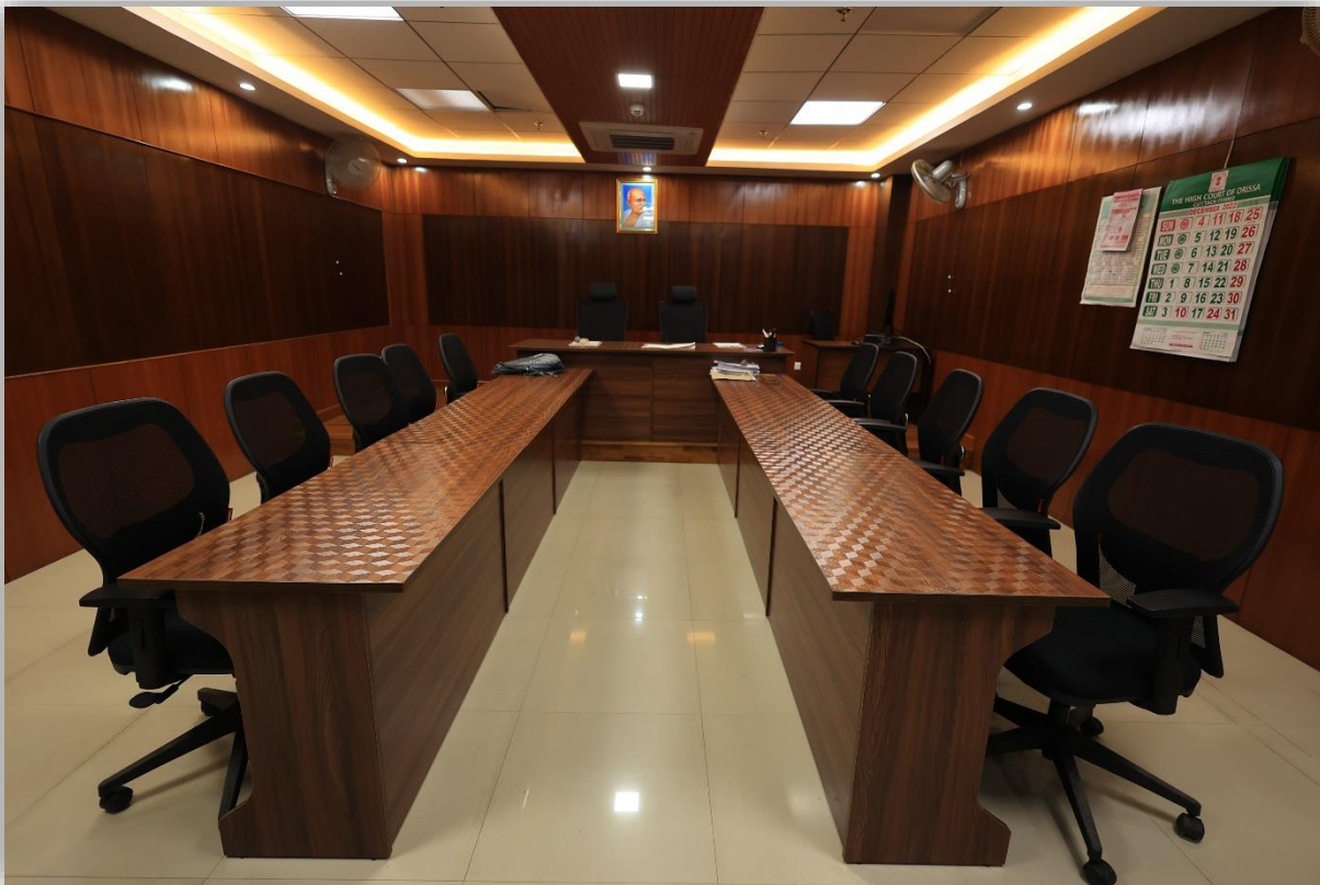
A state-of-the-art Arbitration room at the centre