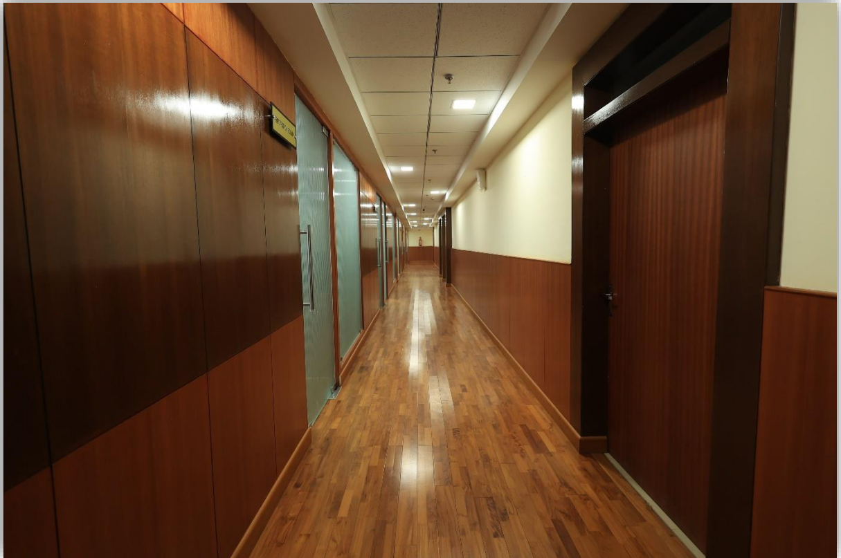
A corridor at the Centre

The staff of Arbitration Centre are deputed from High Court of Orissa. The Coordinator, a Judicial Officer in the Cadre of District judge, being assisted by the Additional Coordinator, an officer in the Cadre of Senior Civil Judge, manages the day-to-day activities of the Centre. A Section Officer is in charge of the Superintendent of the Centre and there are three Assistant Section Officers and two Data Entry Operator-cum Jr. Grade Typist to assist him. In addition, there are two Class -IV employee (peon) who play a very important role in carrying out the daily activity of the Centre.