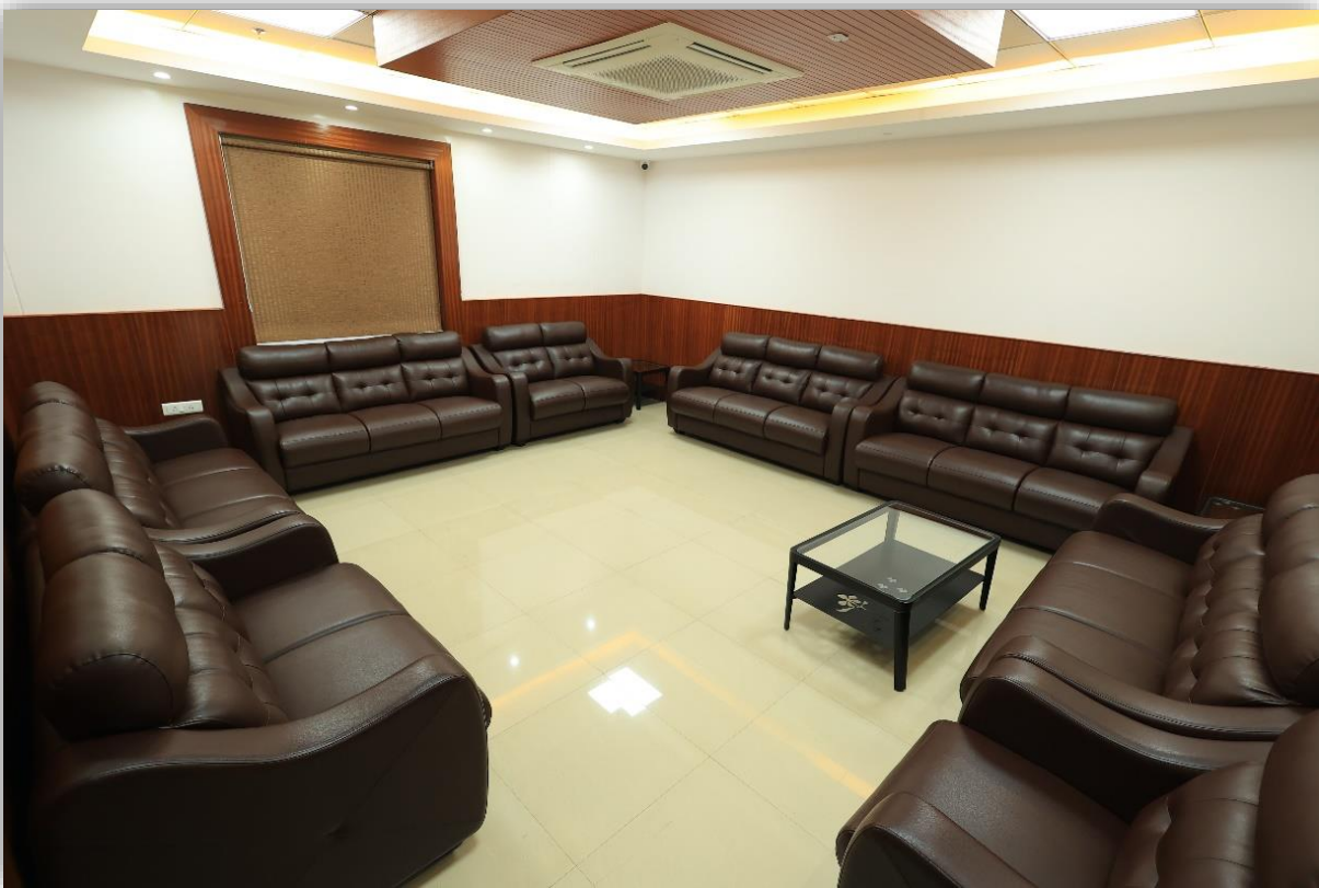
Advocates' lounge at the Centre