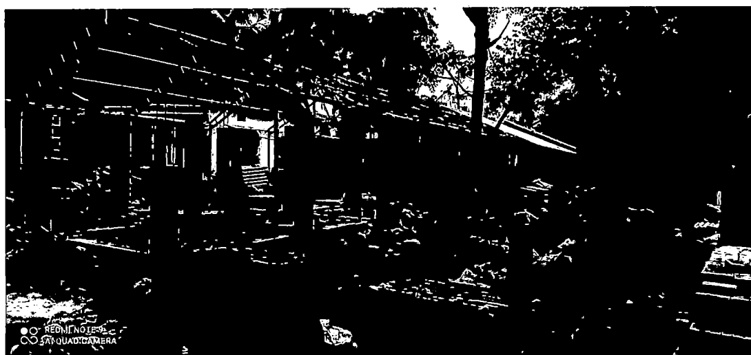
CURRENT STATUS OF THE LEPROSY HOME AT LEWIS COLONY, BALASORE